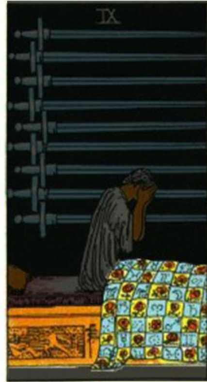
WHAT STANDS OUT